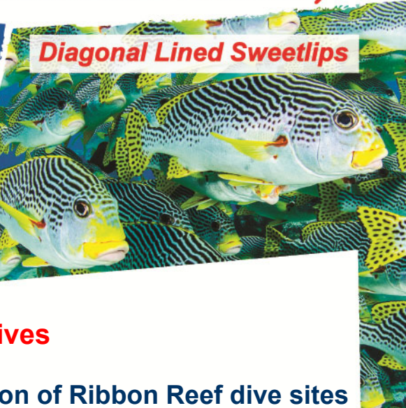
Diagonal Lined Sweetlips