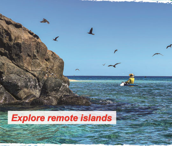
Explore remote islands

Steve's Bommie – a highlight with incredible marine biodiversity, both large and small.